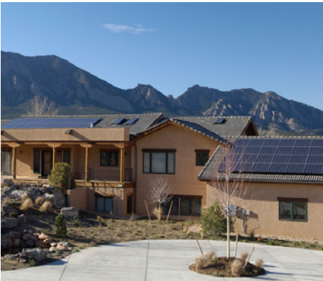
This residence is powered by a 8.3 kW grid-tied solar system with battery backup

SunWize Grid-Tie Systems with Battery Backup are quiet and operate automatically using solar electric technology. As the sun rises, the solar power system begins to deliver utility grade electricity to dedicated loads. Extra power not consumed will feed back into the grid and lower your electric bill. Utility power keeps the battery storage charged and supplies electricity to dedicated loads at night.