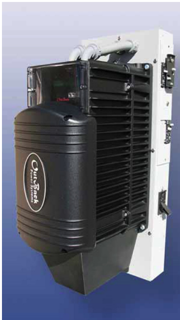
SunWize Power Center Assembly with E-Panel and GFX inverter & MX 60 controller