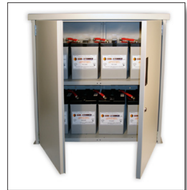
Indoor battery enclosure for 8 Group 31 batteries is key-lockable and constructed of powder-coated steel

Sealed AGM batteries provide 9 kWh (@ 24 hr. rate) of reserve power. Expandable up to 27 kWh. Maintenance-free batteries are designed to last 10+ years in float condition.