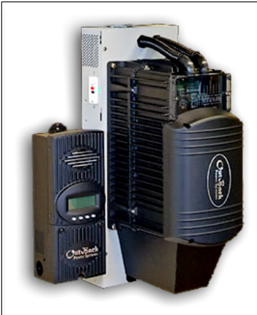
E-Panel, GFX inverter and MX60 controller.

The SunWize inverter power centers are assembled and tested in the ETL-508A listed SunWize factory. These power centers combine the disconnects, over current protection devices and controls into an easy to install and operate panel. System is FSEC approved.